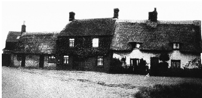
Pic 7: The cottages shown here c1915 had a small shop and post box in the middle cottage while the thatched cottage on the right was demolished some years ago.