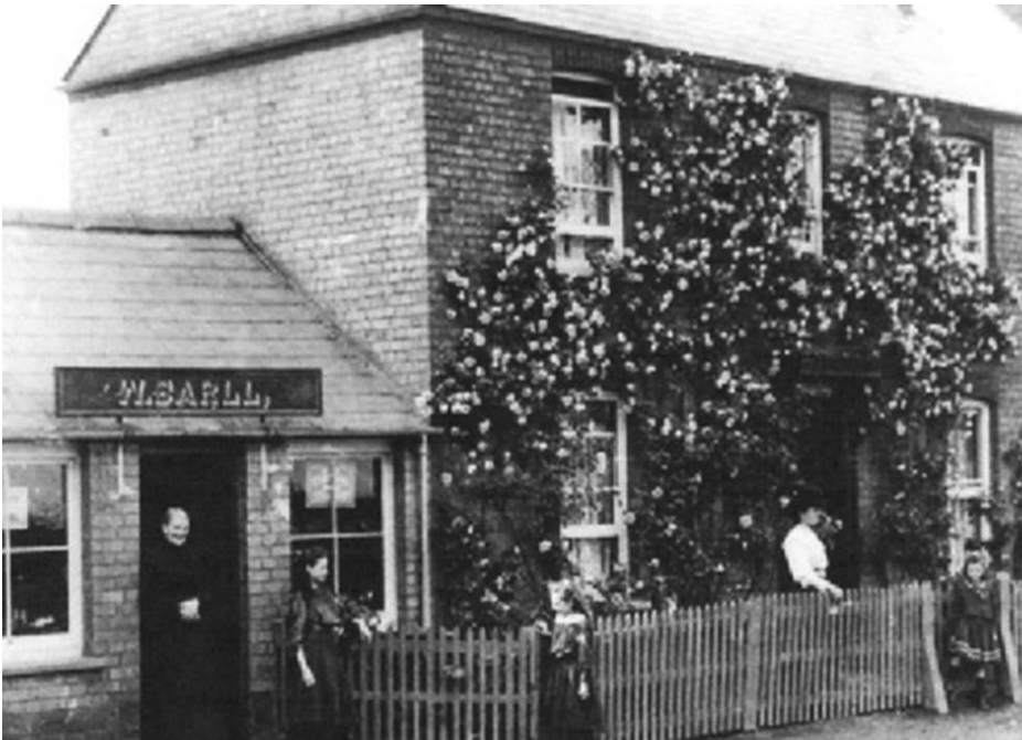
Sarll's Bakery & House, Honey Hill, circa 1910.