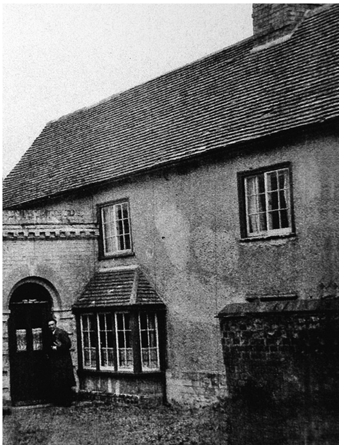
Pic 6: The landlord of the White Horse public house in the Cinques, Herbert Hill taken in 1956 in the doorway. The pub was closed in 1959 which then left only the Green Man in the Hamlet. Once both public houses would be busy but as travel became more widely used one had to close, there now stands a private dwelling on the site.