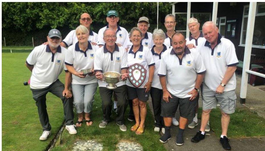
Gamlingay Bowls Club, winners of the Champion of Champions Cup against Melbourn in the Meldreth & District League.

In our last Meldreth & District League game of the season we won the Champion of Champions Cup (a final between the winners of the two M&D League sections) against Melbourn by ten shots.